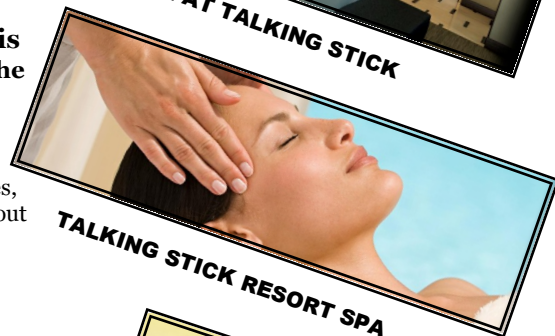
TALKING STICK RESORT SPA