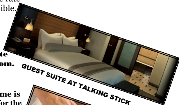
GUEST SUITE AT TALKING STICK

"Whichever course one chooses or prefers, it was our desire to portray golf in a traditional sense, which quietly merges with its tranquil desert surroundings... Talking Stick's North Course, with its broad, angular holes rewards thoughtful play through the rise of its many options according to one's level of skill. Its low-profile, slightly crowned greens and close-cropped approaches encourage running as well as aerial assaults. The South Course, with its tree-lined fairways and raised greens defended at the sides offers a more straightforward style of play." Ben Crenshaw & Bill Coore