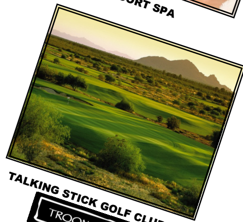
TALKING STICK GOLF CLUB TROON GOLF®