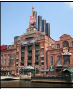
The Hard Rock Cafe