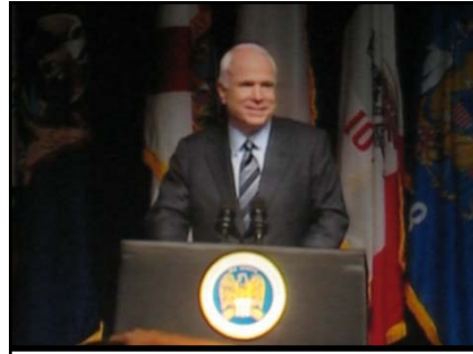
Senator McCain is greeted with applause