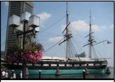
U.S.S. Constellation ~ the jewel of Baltimore's Inner Harbor