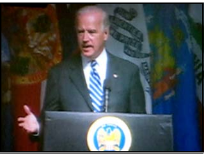
Senator Biden addresses the forum