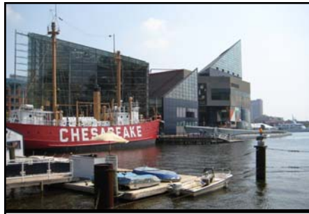
Baltimore's Aquarium & Maritime Museum