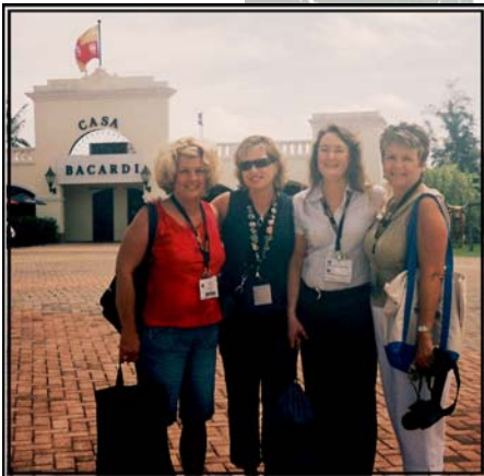
Spouses Tour— Bacardi Rum Factory